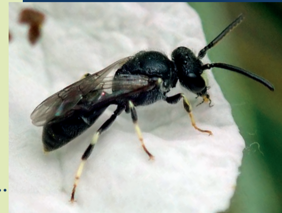
Hairy yellow-face bee

A yellow, night-flying moth with distinctive brown-and-white spots on its angular forewings. It frequently visits gardens, but also likes woods, scrub and grasslands.