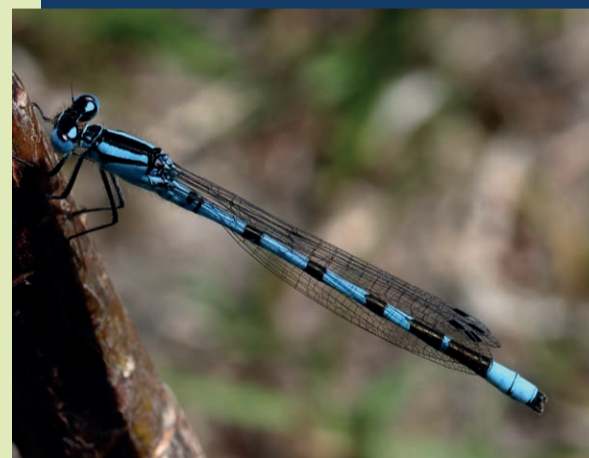
Common blue damselfly

The male Common blue damselfly is pale blue with bands of black along the body. It can be found around almost any waterbody and is a regular visitor to gardens from April to September.